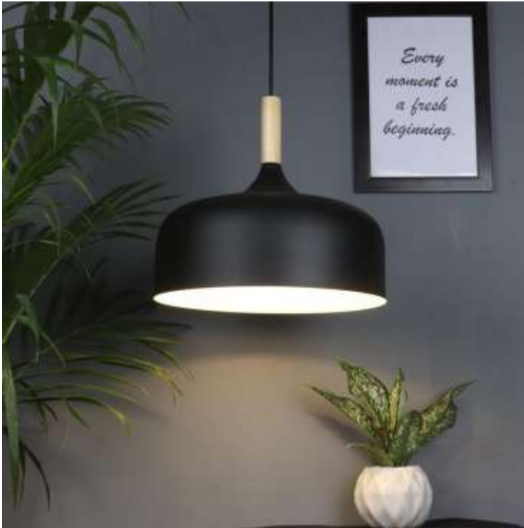
ML1135 DIA 14"HT 11" PRICE :-2100