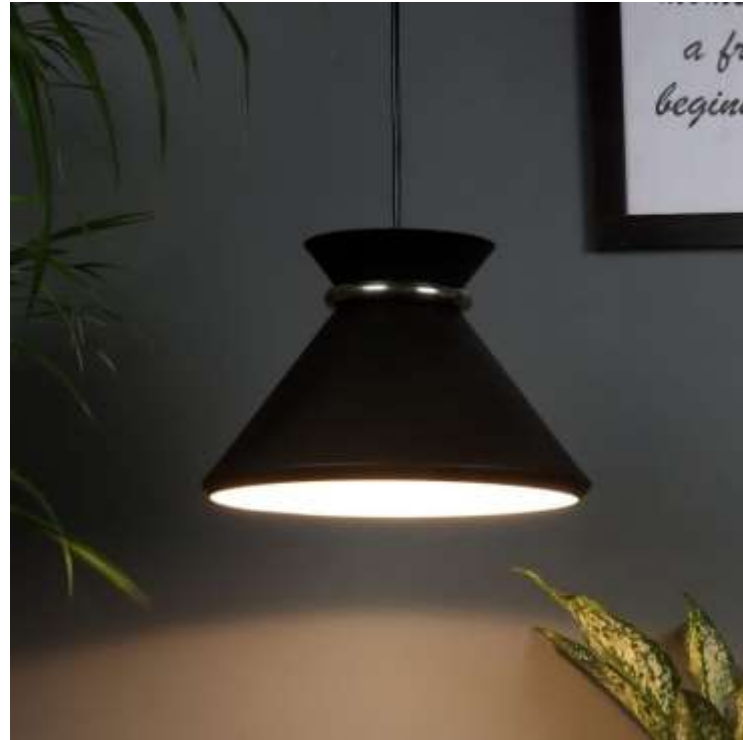
ML 301 DIA 10". HT 9" PRICE 1800RS