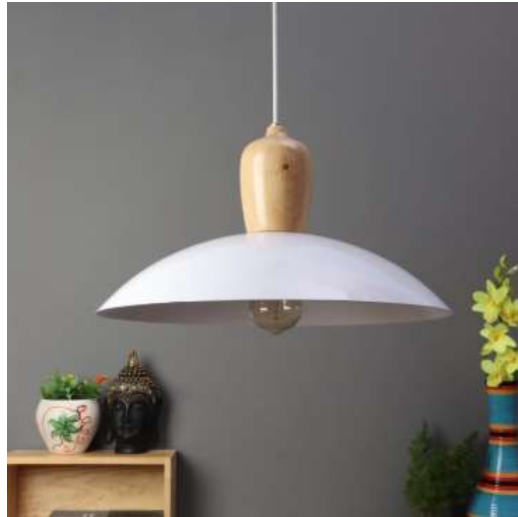
ML 16 DIA 16" HT 9" PRICE :- 2100RS