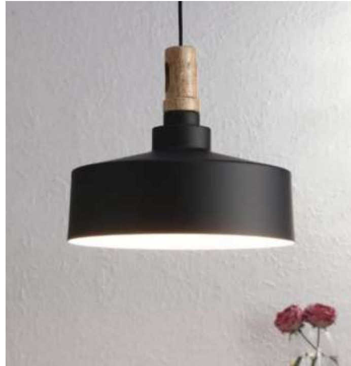
ML 13 DIA 13", HT 11" PRICE 1800RS