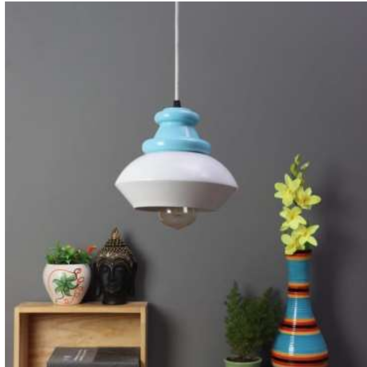
ML BOWL DIA 8" HT 7" PRICE 1650RS