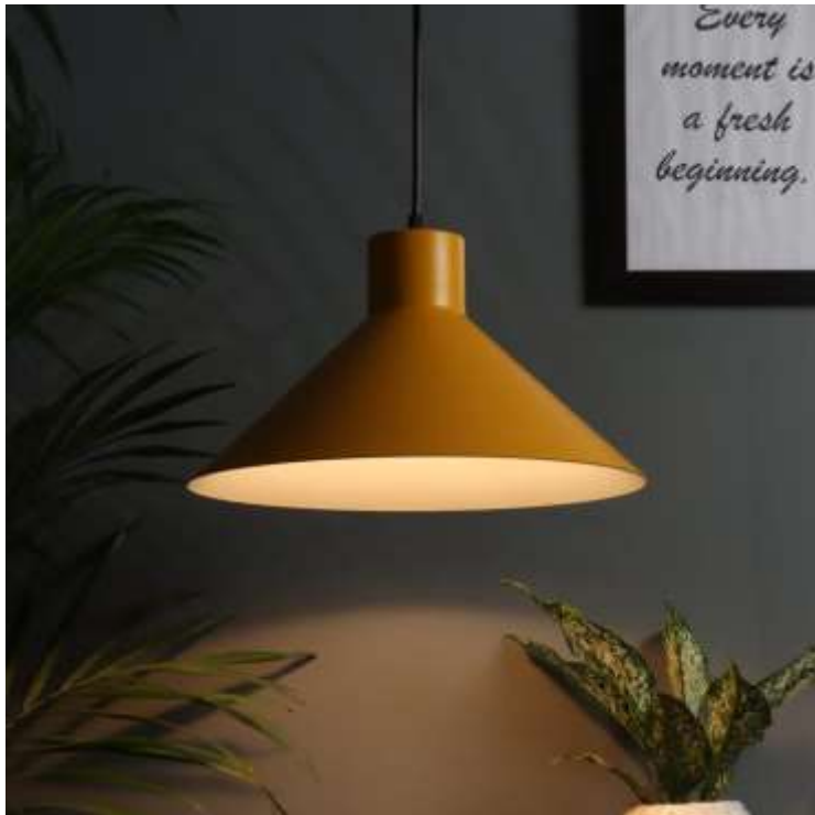
ML 201 DIA 13" HT 9" PRICE :- 1350 RS