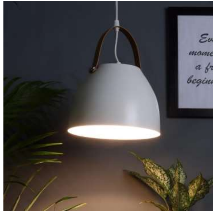
ML DRUM BELT DIA 8", HT 11" PRICE 1800