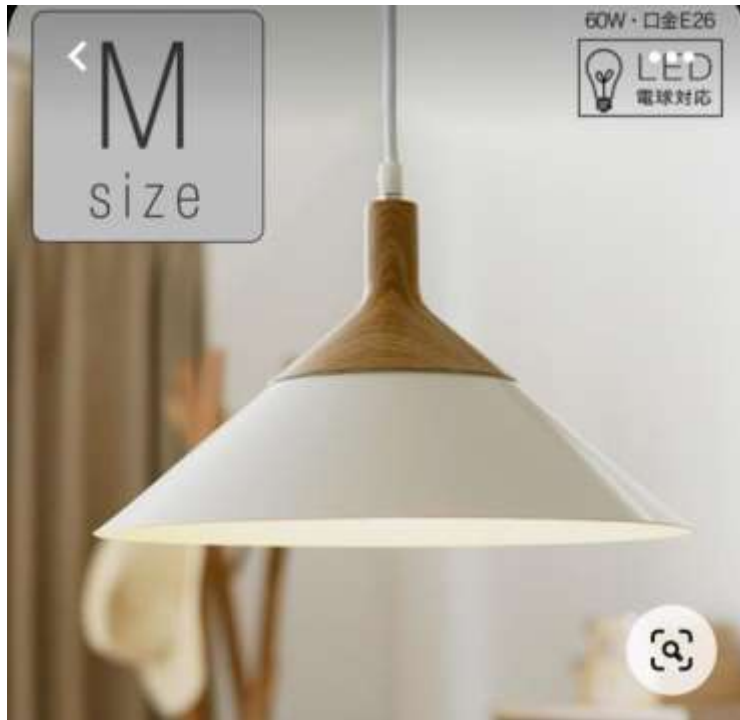
ML 113 WOOD DIA 13" HT 11" PRICE 2400