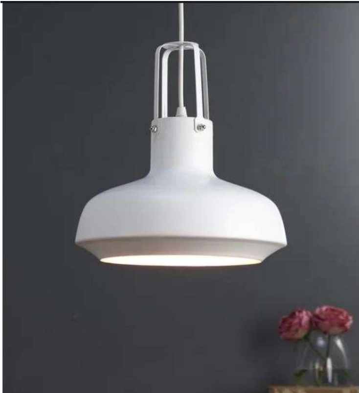
ML 01 DIA 11", HT 12" PRICE :- 1500