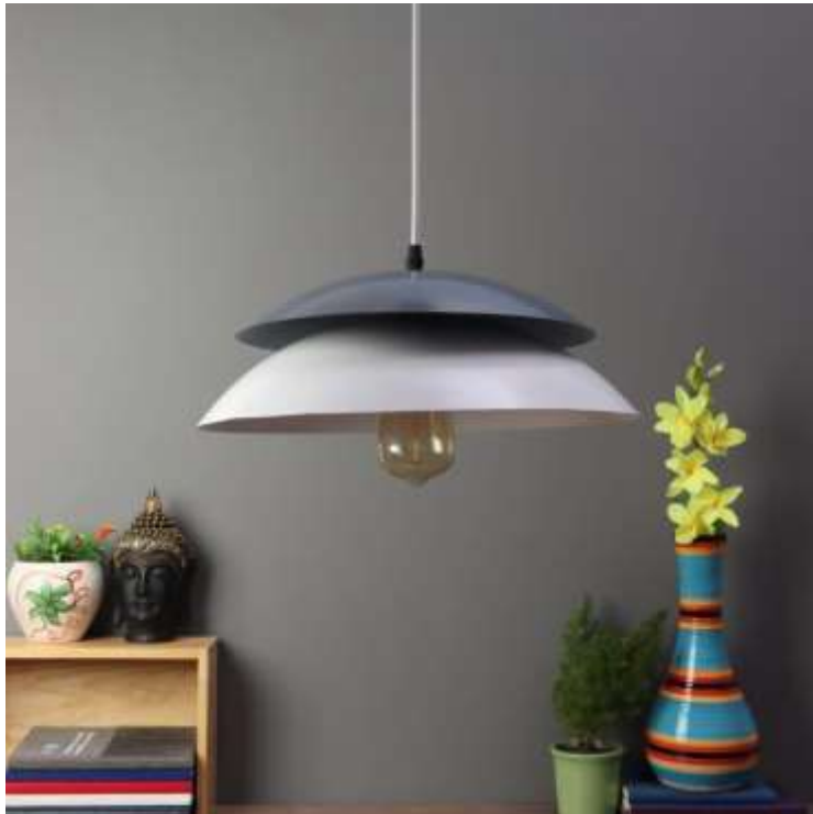
ML DISH DIA 14", HT 7" PRICE 2100RS