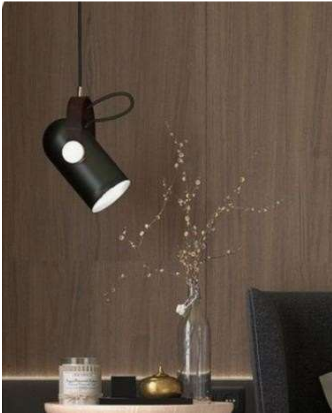
ML CYLENDER 105 DIA 5" HT 11" PRICE :- 1350