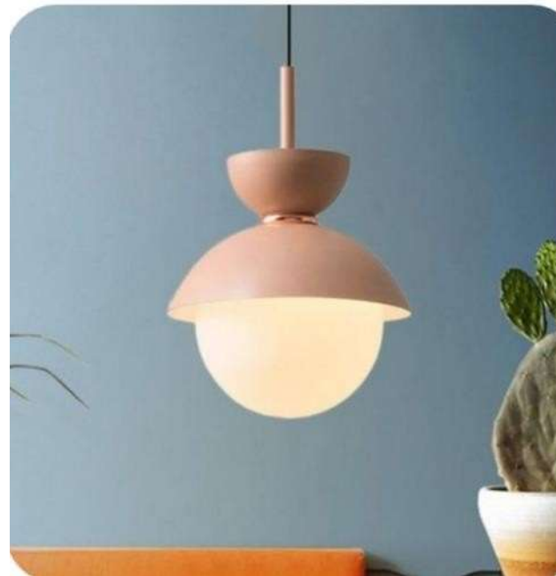
ML4011 DIA 10", 8" GLASS GLOBE HT 8" PRICE 2700RS