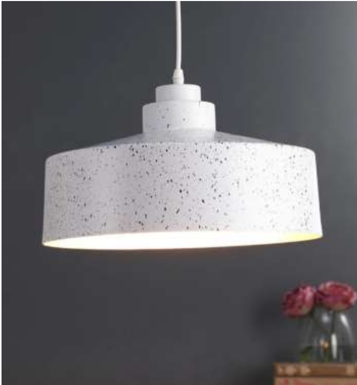
ML MARBLE FINISH DIA 13" HT 8" PRICE 1800RS