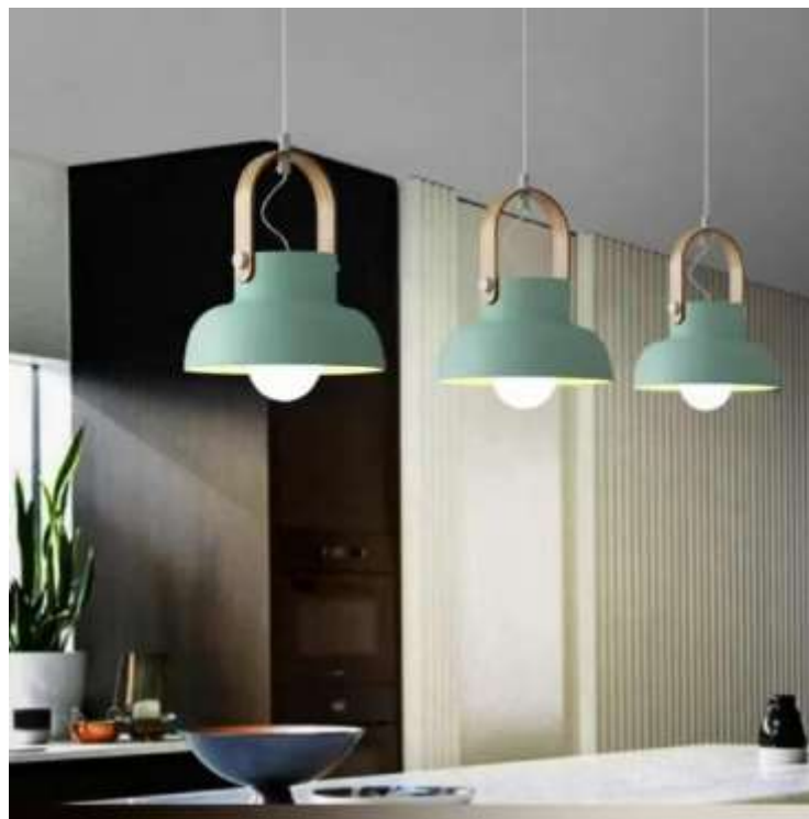
ML511 GREEN DIA 11",HT 11" PRICE :-2100