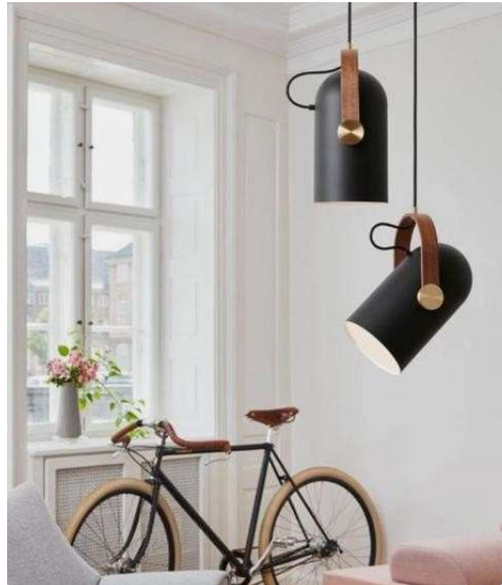
ML CYLENDER 105 SET OF TWO PRICE:- 2700