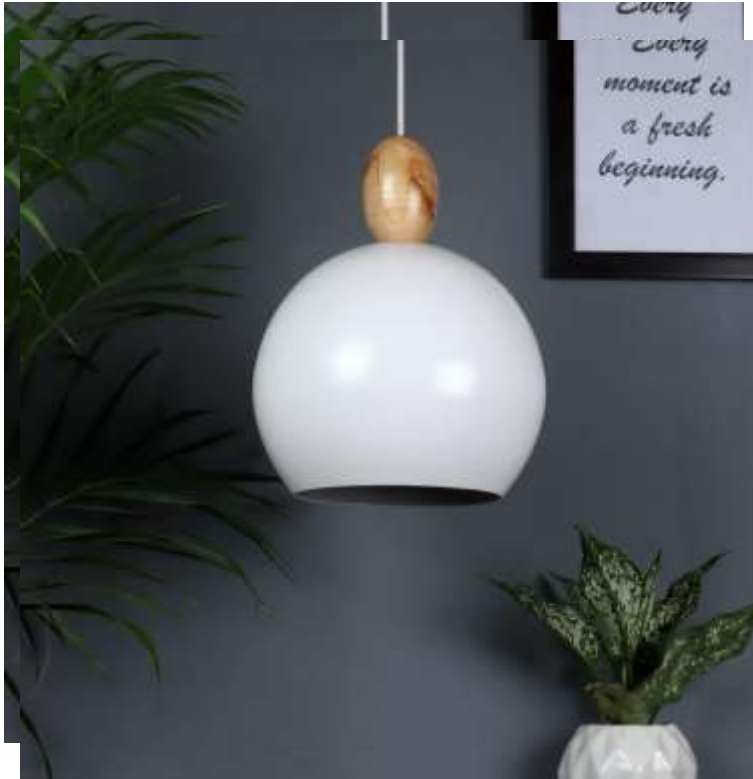
ML 10 BALL DIA 10" HT 12" PRICE 1800 RS