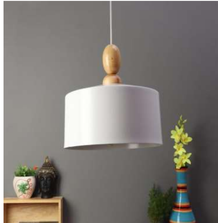
ML03 DIA 14" HT 14" PRICE 2400RS