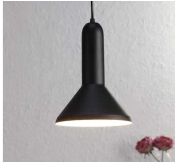
ML 07 DIA 7" , HT 11" PRICE 900RS