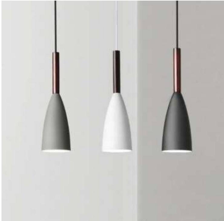
M05 SET OF 3 GREY/WHITE/BLACK PRICE :- 3000