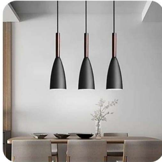
M05 SET OF 3 BLACK PRICE:-3000