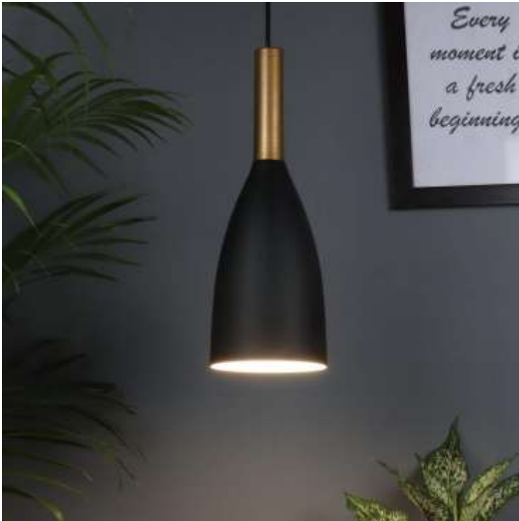
ML 05 BOTTLE DIA5", HT 14" PRICE 975