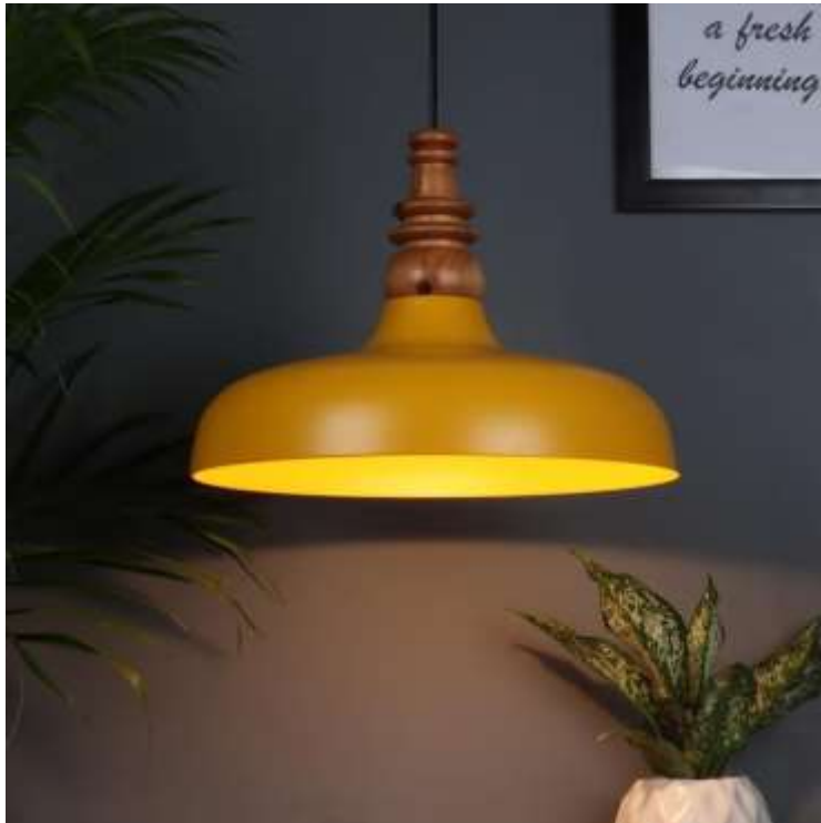
ML 104 DIA 14", HT 10" PRICE 1800