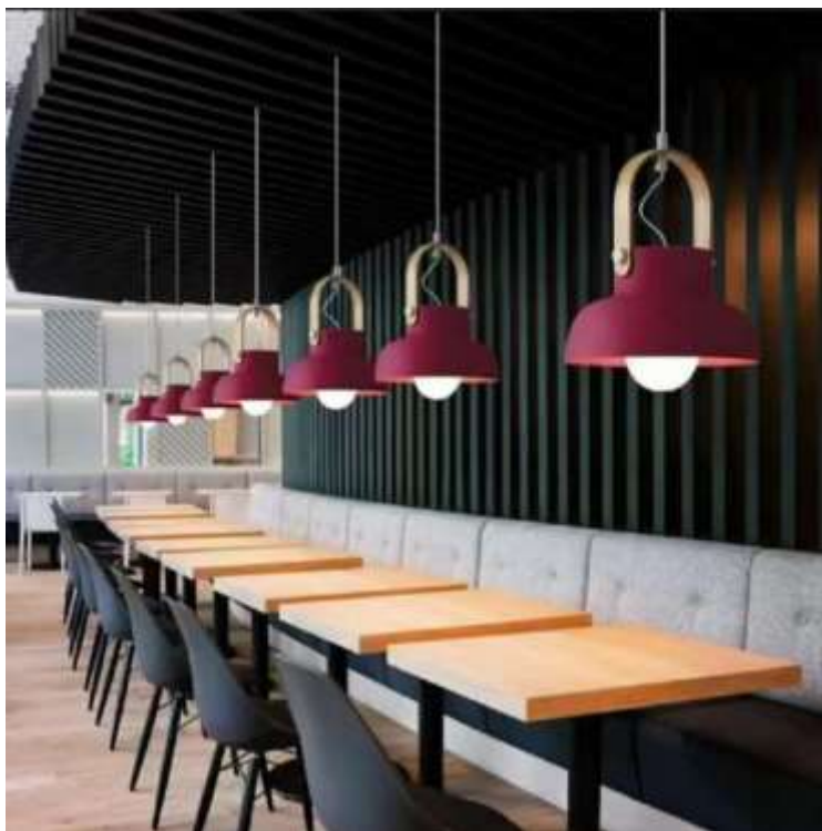
ML511 MAHROON DIA 11",HT 11" PRICE :-2100