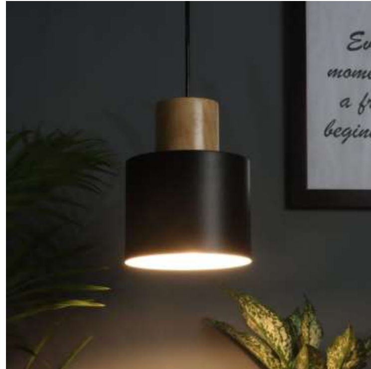
ML 801 DIA 6"HT 8" PRICE 1500RS