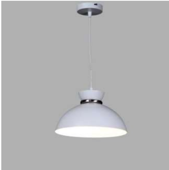
ML401 DIA 10", HT 8" PRICE :-1800RS