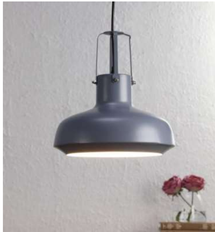
ML 01 DIA 11", HT 12" PRICE :- 1500