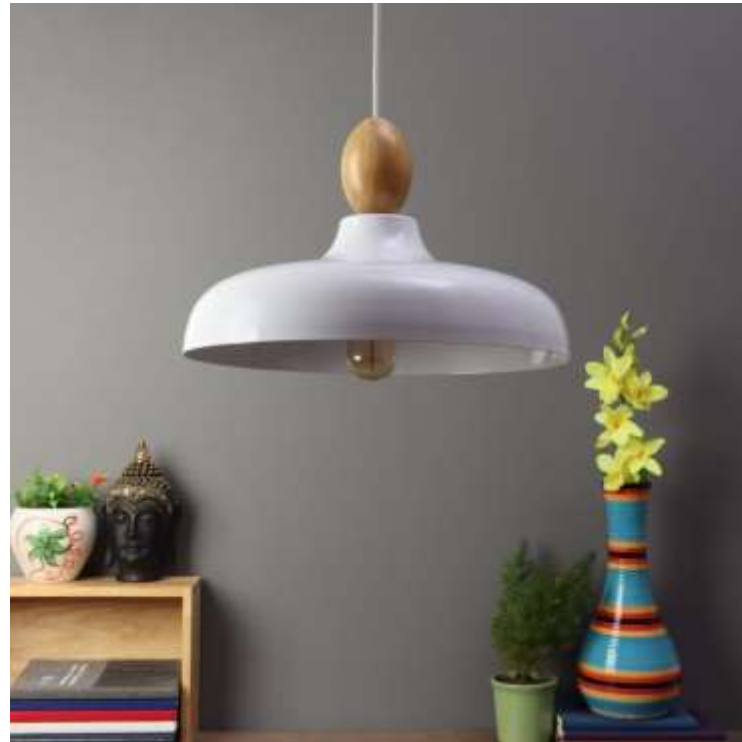
ML 04 DIA 14", HT 9" PRICE :- 1800