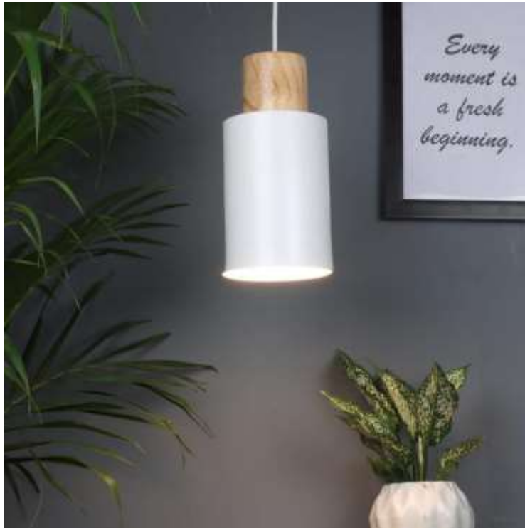
ML 701 DIA 5"HT 10" PRICE 1500RS